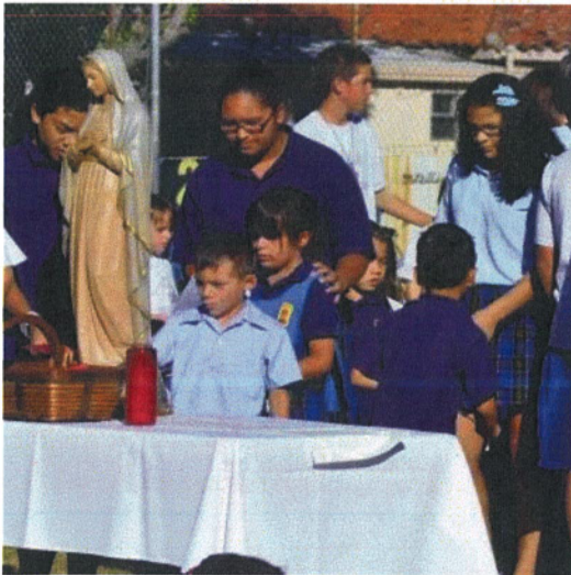
Above, OLA students present their prayer cards during the Living Rosary.